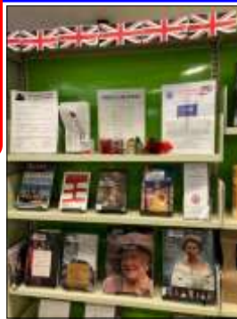
St. George's Display at Terry Fox Library