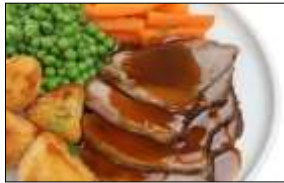
Roast Beef and Yorkshire Pudding

I will do a break down of results and report the findings of our membership in the next "Dragon Fire"