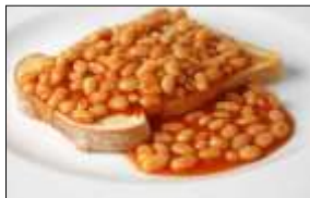
Beans on Toast