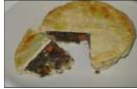
Steak & Kidney